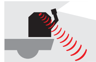
Speed-synchronized output, radar controlled, FONTAN Mobilstar ER