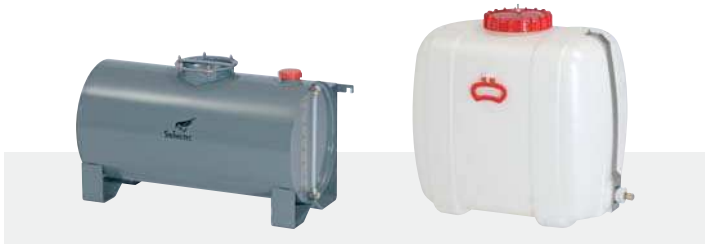
Chemical tank, stainless steel, capacity 69 l, standard with FONTAN Mobilstar M, optional accessory FONTAN Mobilstar E and ER