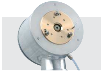
Spraying head ULV/LV