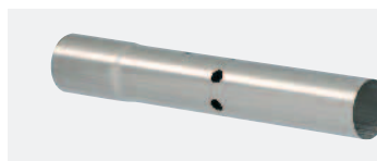
Standard fogging tube for oil-based fogging mixtures