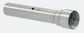
High performance fogging tube for water-based fogging mixtures only