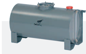
Chemical tank, stainless steel, capacity 69 l, SWINGFOG SN 101 Pump