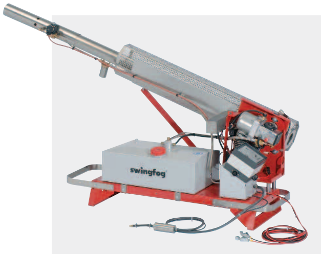
SN 101 PUMP