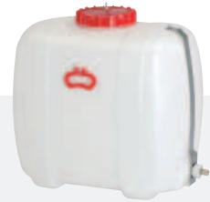
Chemical tank, polyethylene, capacity 150 l, SWINGFOG SN 101 Pump (also available with capacities 80 l, 300 l, 500 l)